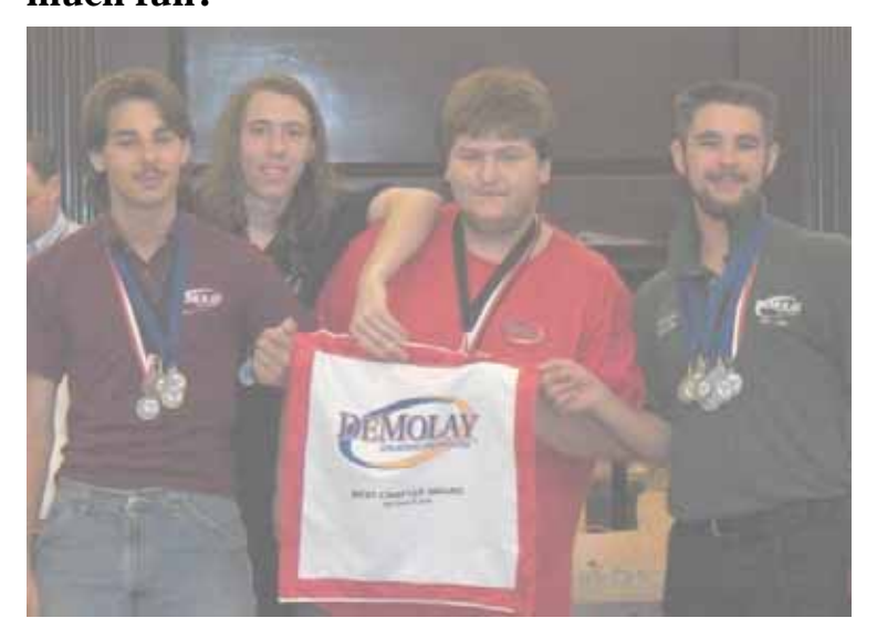
Capital City members hold their second place banner.